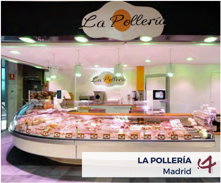
LA POLLERÍA Madrid