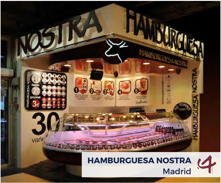
HAMBURGUESA NOSTRA Madrid