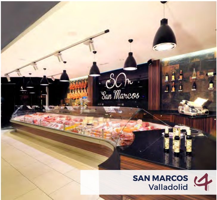
SAN MARCOS Valladolid