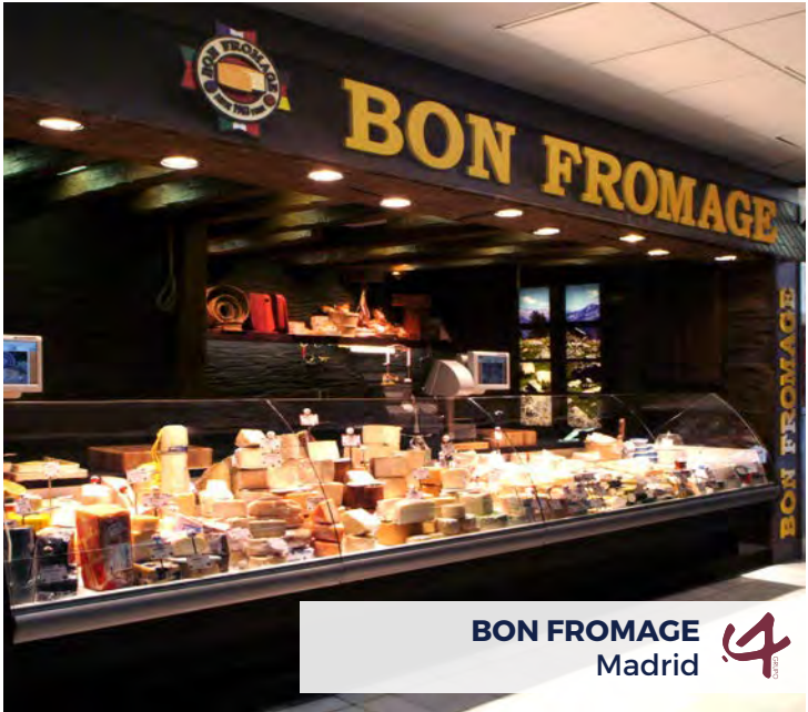
BON FROMAGE Madrid