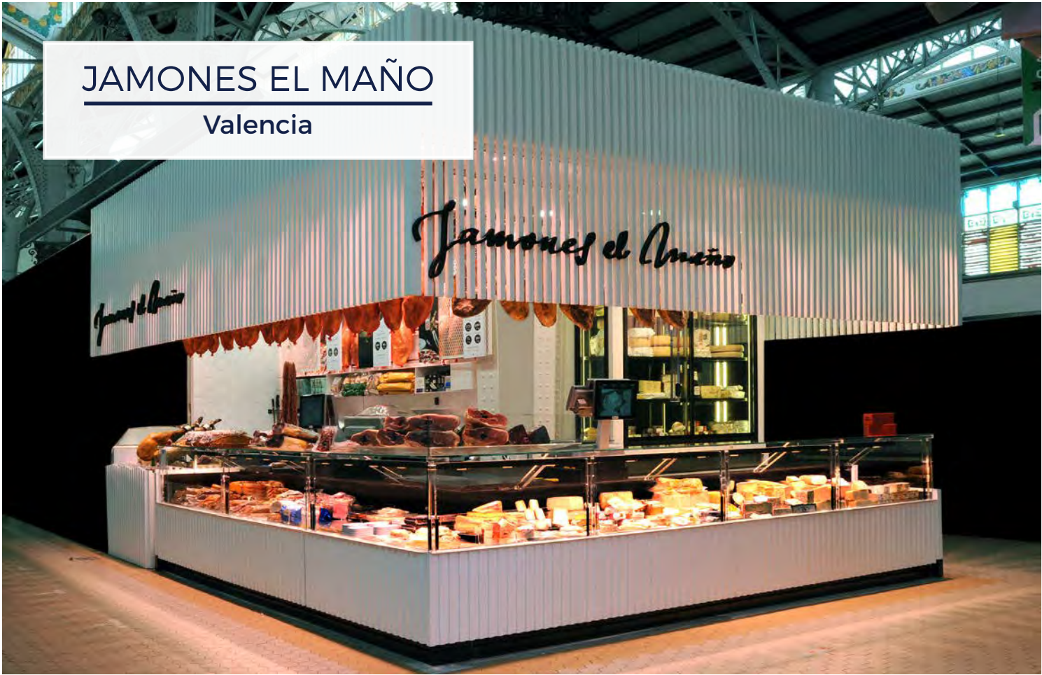
JAMONES EL MAÑO Valencia